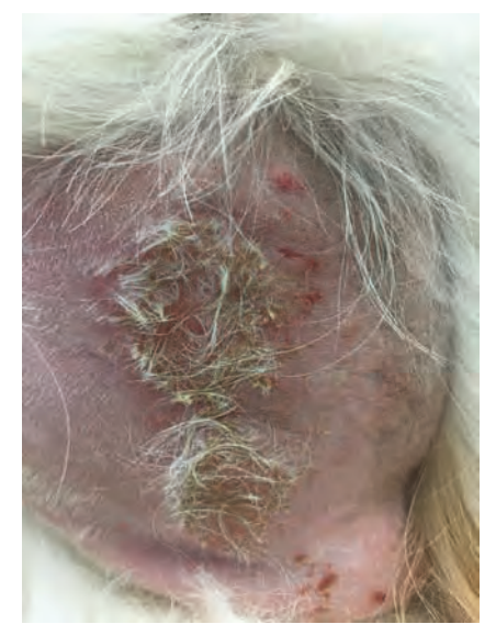
Figure 1. A typical "hot spot" with moderate erythema, sparse papules, moderate exudate and fine crusts on a 9-year-old Maltese Terrier crossbreed dog at visit 1 (pre-treatment). Note: hair over the lesion has been clipped.

on the history and the characteristic clinical signs of superficial bacterial skin infection (Figure 1).