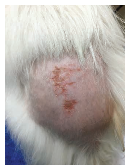
Figure 2. The same dog as in Figure 1 after 7 days of treatment with Pet putty. There is superficial ulceration, resolution of papules and mild erythema. The hair over the lesion was clipped.

Each dog was examined 7 days after the first visit (Figure 2). Medications were withdrawn and the dogs then re-examined 28 days after the first visit. Owners were asked to complete a short questionnaire on their experience using the prescribed products.